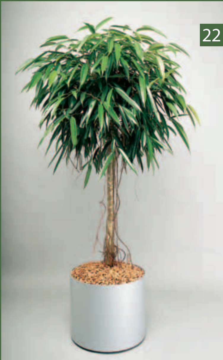
22 Ficus binnendijkii „Alii“ -Saber Ficus, standart low - bright polystyrene planter Ø 60 cm, 43 cm hoch hidden rollers „rosso“ stones