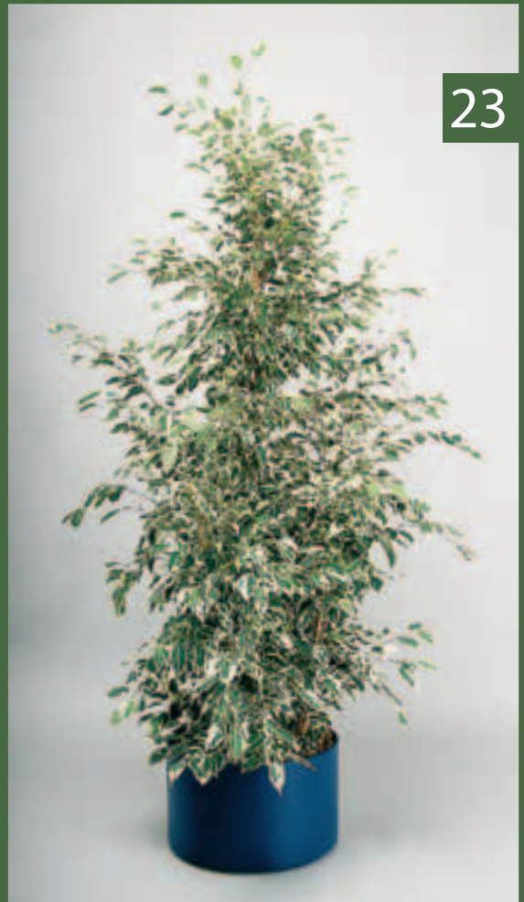
23 Ficus benjamina „Golden King“ bright - sunny polystyrene planter Ø 37 cm, 23 cm tall