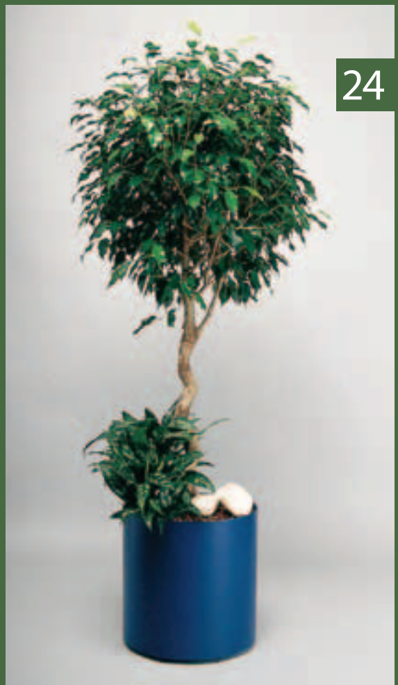
24 Ficus benjamina - Benjamin Tree, standart small: Aglaonema „Marie“ bright light polystyrene planter Ø 37 cm, 36 cm tall „rainbow“ stones hidden rollers